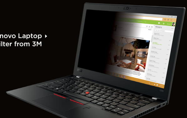
Lenovo Laptop ▶ Privacy Filter from 3M