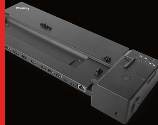
◀ ThinkPad Ultra Dock