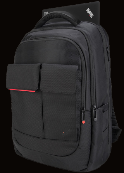
ThinkPad Professional ▶ Backpack