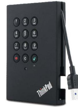
ThinkPad USB 3.0 Secure Hard Drive (PN: 0A65621)

Optimized for safeguarding essential data while on the go, this hard drive offers high-level, 256-bit Advanced Encryption Standard (AES) security within a slim, lightweight, self-powered, and easy-to-use design. It features an integrated, high-quality, metal dome switch keypad for entering an 8 to 16 digit password for one administrator ID and one additional user ID, if required.