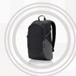
ThinkPad Active Backpack