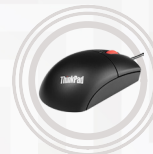
ThinkPad USB Travel Mouse