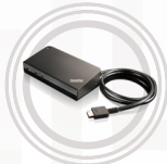
ThinkPad USB 3.0 Pro Dock