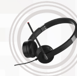
Lenovo Stereo 3.5 mm Headset