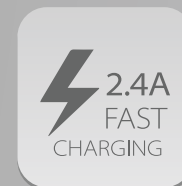
Ultra Fast Charging and Recharging Speed