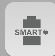
TP-LINK Smart Charging