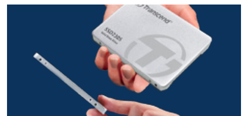
Ultra-slim 6.8mm form factor