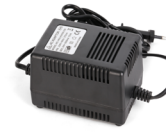
AC24V/3A Power Adapter