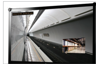
On top of PIP and PBP, Smart Omni Viewer offers selectable aspect ratios and the option of 180° image rotation