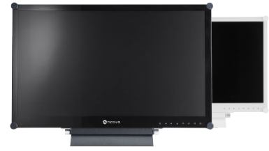
Available in black or white