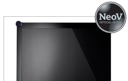
NeoV™ Optical Glass protects against scratches, impacts and other physical damage