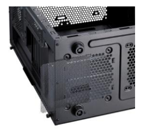
Bottom dust filter