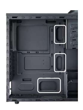
Three cable routing grommets on the M/B tray for cable management