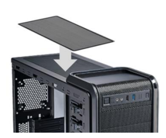
Top magnetic dust filter for easy maintenance