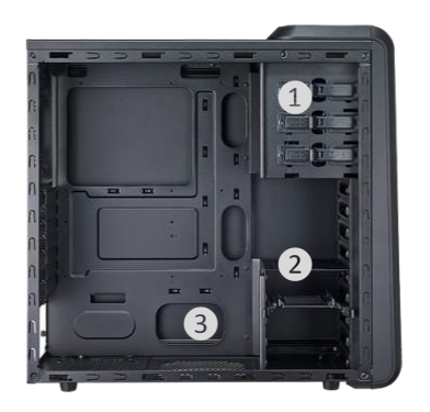
1 5.25" bay x 3