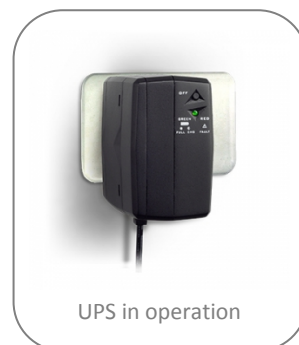
UPS in operation

The UPS is equipped with 1m long cable and its compact size allows fitting it between other plugs in an extension cord. 12VDC is a global standard and 25W output on coaxial DC connector (OD 5.5mm / ID 2.5mm) will be compatible with most of your devices. High quality Samsung Lithium-Ion battery provides 3h backup time for typical router.