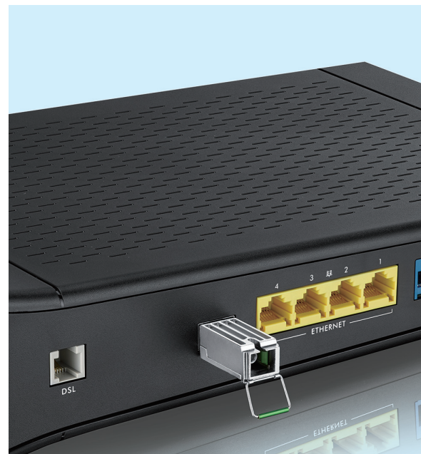
PMG3000 inserted in a gateway with SFP slot