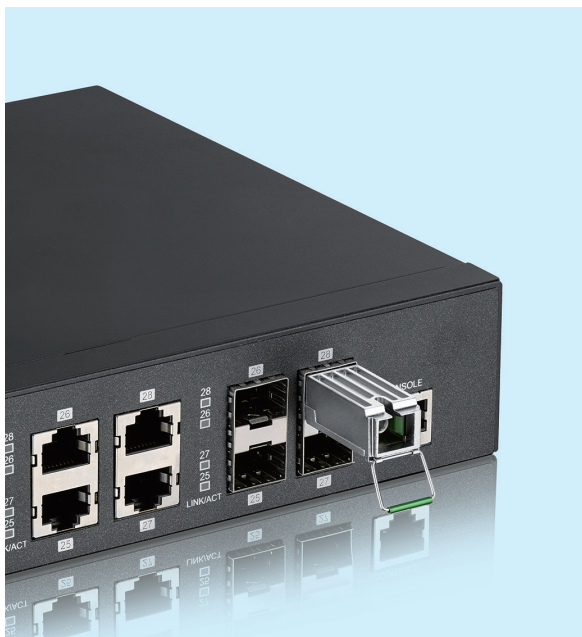
PMG3000 inserted in a switch with SFP slot