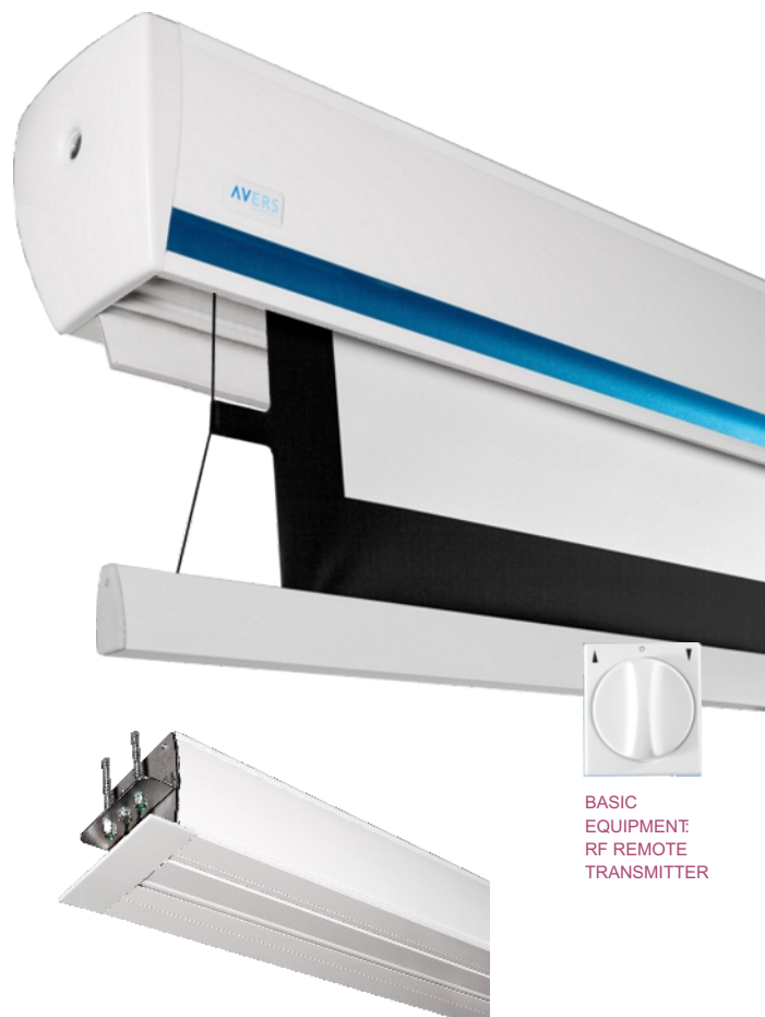
BASIC EQUIPMENT: RF REMOTE TRANSMITTER