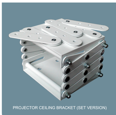
PROJECTOR CEILING BRACKET (SET VERSION)