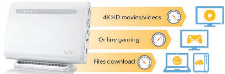
Smart QoS prioritizes applications for best experience