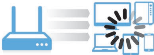
No QoS, no priority, everyone is waiting

The ZyXEL NBG6815 allocates the right amount of bandwidth to each networked devices automatically with StreamBoost™ technology. Play an intense online multiplayer game, watch high-definition streamed movies, browse your social networks, download a large file or do even more – all at the same time without experiencing any performance drop.