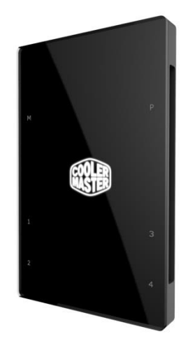
Or 2) require RGB control box ( sold separately)