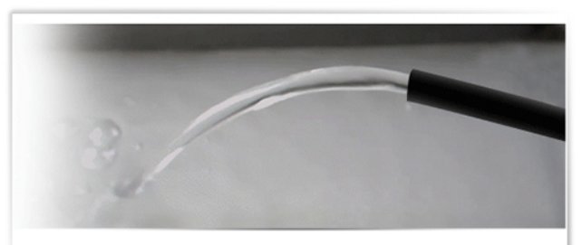
High-quality EPDM rubber tube to offer a better liquid flow channel

Bionic LED breathing light lightening up while operating