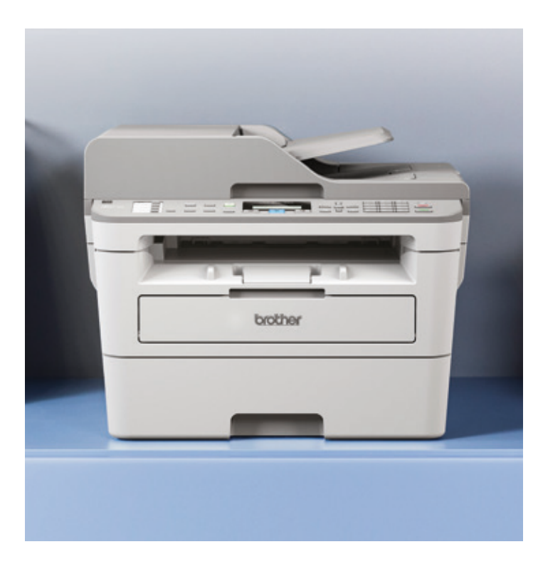
<sup>a</sup> Between 500 - 1,500 prints per month

The new tonerbenefit range comes with a host of time-saving features, ensuring that you are never waiting long for that important document. You can now be productive with industry leading print speeds of up to 34 pages per minute. Engineered with a 250 sheet paper tray, together with automatic 2-sided print as standard, puts this range into a class of its own.