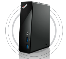
ThinkPad® Basic USB 3.0 Dock