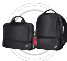
ThinkPad® Essential Line Carry Case