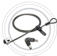
Kensington® MicroSaver Security Cable Lock from Lenovo®