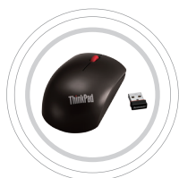
ThinkPad® Optical Wireless Mouse