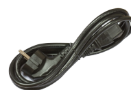
2x IEC cord