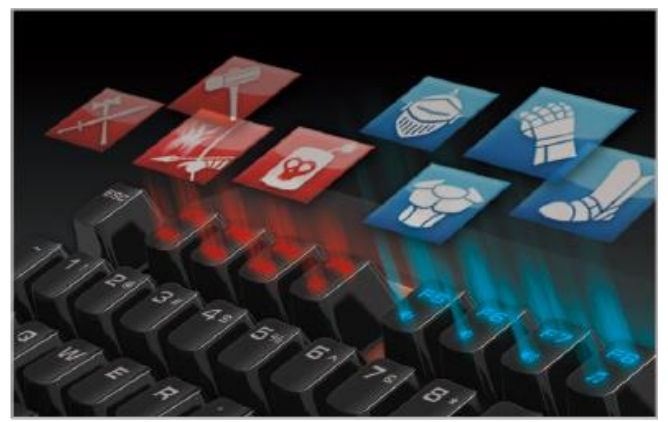
On-board recording of up to 30 macros