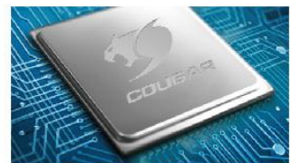
32-BIT ARM PROCESSOR

A comfortable design that adapts perfectly to right and left-handed users, blending hand and mouse into a single ultra-precise tool.