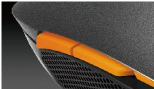
2 x SIDE KEYS