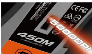
5000 DPI ULTRA-PRECISE OPTICAL GAMING SENSOR

Superior computing speed. 512KB ON-BOARD MEMORY Storage for up to 3 profiles on the mouse. Allows the user to bring his full configuration to another PC without further configuration.