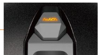
ON-THE-FLY DPI ADJUSTMENT

Allows the user to quickly switch between different DPI settings on the go.