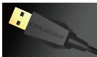
GOLDEN-PLATED USB PLUG

The PMW3310DH Optical Sensor provides you with pinpoint control.