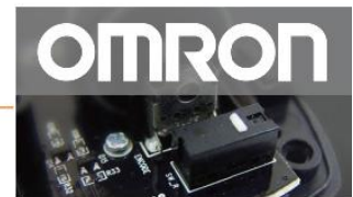
OMRON MICRO SWITCHES

Freely choose 1 out of 16.8 million colors to easily identify each profile and personalize the mouse's appearance.