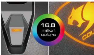
MULTI-COLOR BACKLIGHT SYSTEM (2 ZONE RGB)

The ALPS encoder and the rubberized scroll wheel provide an extremely accurate tactile feedback.