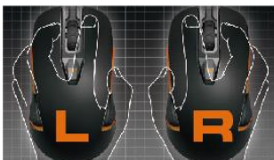
ERGONOMIC AMBIDEXTROUS DESIGN

A comfortable design that adapts perfectly to right and left-handed users, blending hand and mouse into a single ultra-precise tool.