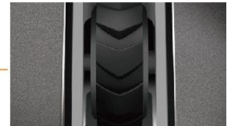
GAMING-GRADE SCROLL WHEEL

The ALPS encoder and the rubberized scroll wheel provide an extremely accurate tactile feedback.