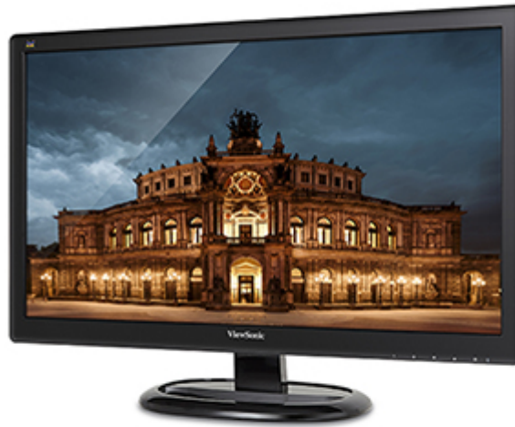
3000:1 Static Contrast Ratio