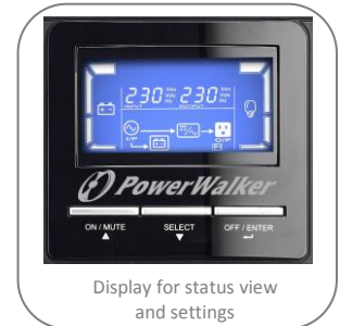
Display for status view and settings