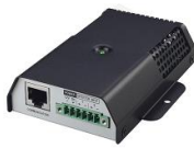
EMD for SNMP Manager Environmental Monitoring Device Monitor Temperature & Humidity Datasheet: Link Item No.: 10120544