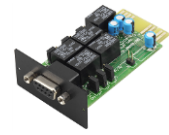
AS/400 Card Datasheet: Link Item No.: 10120515