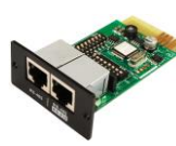
Modbus Card Datasheet: Link Item No.: 10120565