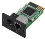
SNMP manager Datasheet: Link Item No.: 10120505