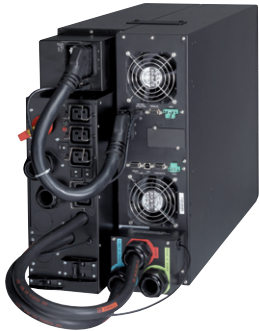
9PX 11kVA with Maintenance ByPass