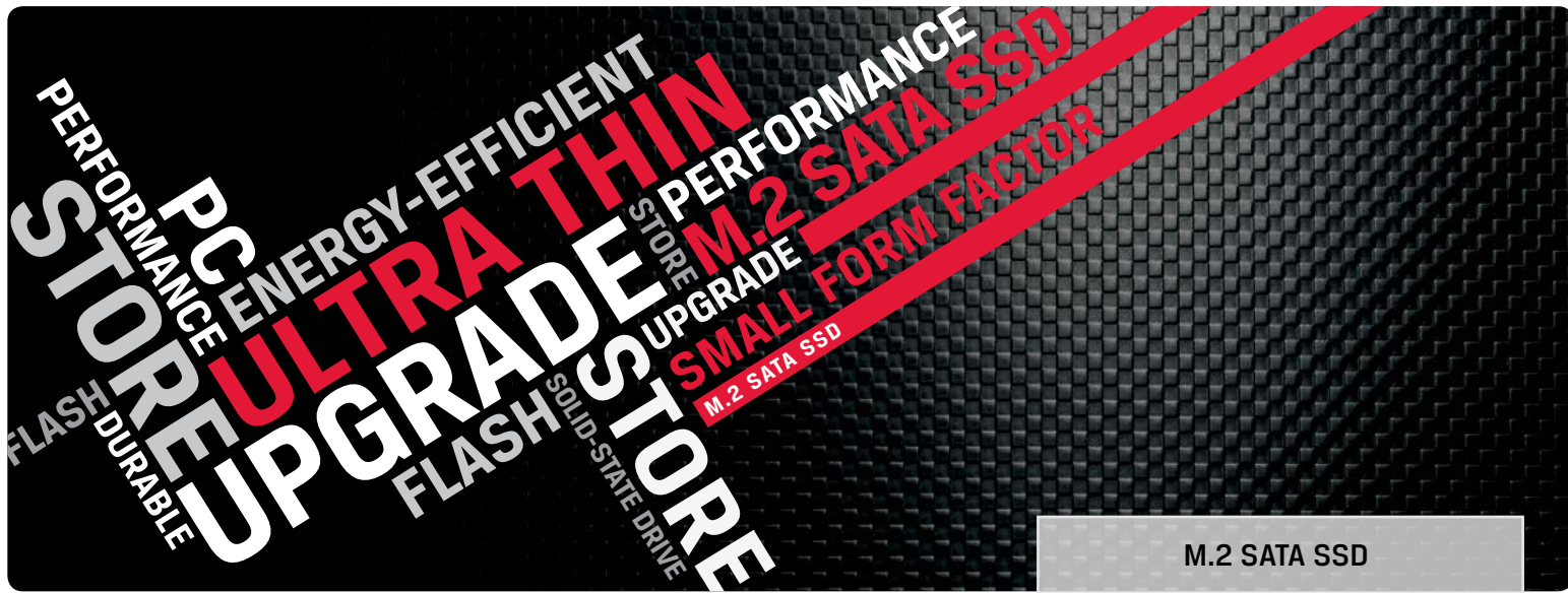
M.2 SATA SSD