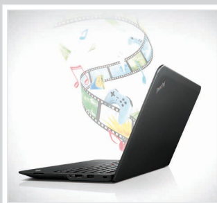
SUPERIOR MULTIMEDIA EXPERIENCE Up to AMD® Radeon™ HD 8670M 2GB discrete graphics