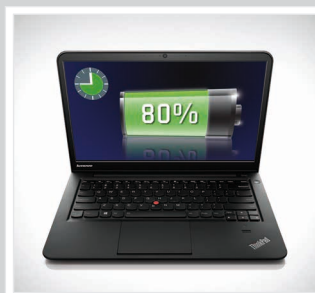
RAPID CHARGE Charge 80% of the battery in 45 mins