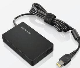
ThinkPad 65W Slim AC Adapter (0B474xx)