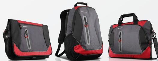
Lenovo Sport Backpack (0A33896), Lenovo Sport Slimcase (0A33897), Lenovo Sport Messenger (0A33898)