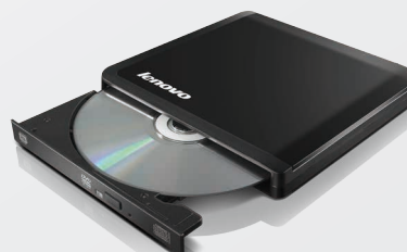
Lenovo Slim USB Portable DVD Burner (0A33988)