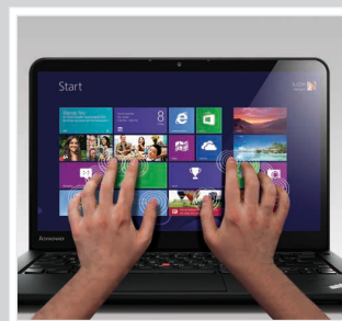
OPTIMIZED FOR WINDOWS 8 Designed for a true Windows 8 experience with a 10-finger touchscreen

Designed for the future, the Lenovo® ThinkPad® S440 is a versatile, high performance touch-enabled* Ultrabook™. Equipped with the latest Intel® Core™ i7 processor and discrete graphics of up to 2 GB, this Ultrabook™ packs raw processing power in an elegant package. Dolby® Home Theater® delivers an immersive multimedia experience. Add to that, enhanced VOIP with noise cancellation, Voice Control* and Motion Control* and you have an unparalleled computing experience for work and play.