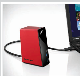
SIMPLIFIED WORK SPACE The revolutionary OneLink technology to power and dock the notebook with the same cable