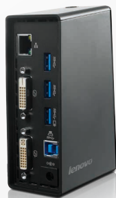
Lenovo® OneLink Dock (4X10A060xx) 1