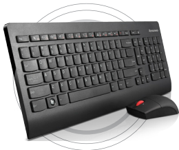
Lenovo® UltraSlim Wireless Keyboard and Mouse Combo