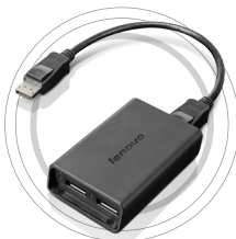
Cables Lenovo® DisplayPort to DisplayPort and Lenovo® DisplayPort to Dual-DisplayPort