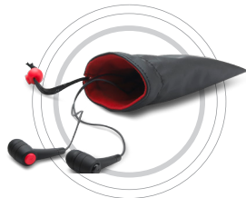
ThinkPad® In-Ear Headphones