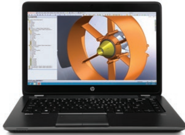
HP ZBook 14 Mobile Workstation

Deliver your best work on the go using the world's first workstation Ultrabook™ 1