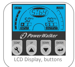
LCD Display, buttons