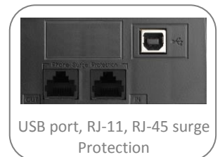
USB port, RJ-11, RJ-45 surge Protection