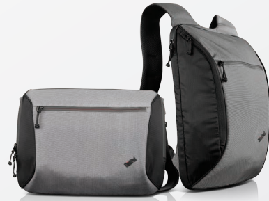
ThinkPad® Ultralight Topload (0B47307) and Backpack (0B47306)