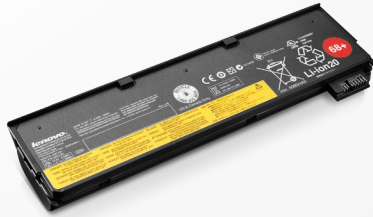
ThinkPad Battery 68+ (6 cell) (0C52862)