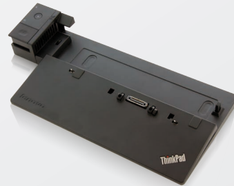
ThinkPad Pro Dock - 90 W (40A10090xx)