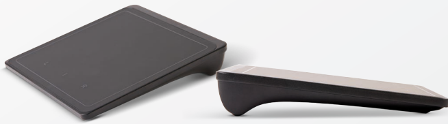
Lenovo® Wireless TouchPad (for Non-touch T440s models) (0A33909)