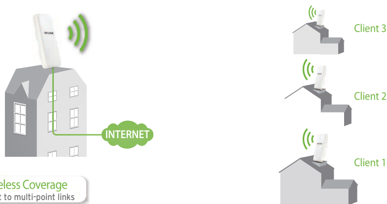
3 Wireless Coverage Point to multi-point links