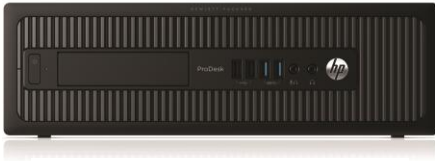
Small form factor

Add a little style to the workplace. HP business PCs feature a new industrial design with rounded edges and other features to help the system look newer for longer.