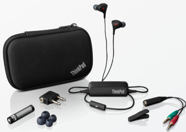
ThinkPad® Noise-Cancelling Earbuds