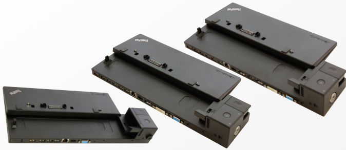
New ThinkPad® Docking (Basic, Pro, and Ultra)