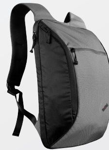
ThinkPad® Ultralight Backpack