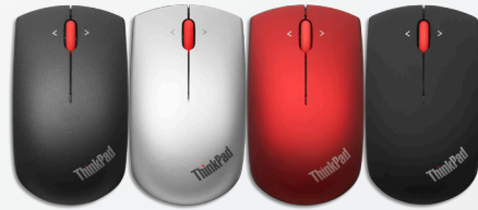
ThinkPad® Precision Wireless Mouse