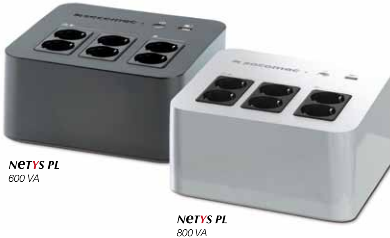
NETYS PL 600 VA