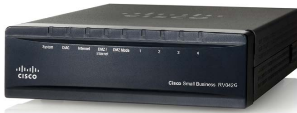
Figure 1. Cisco RV042G Dual Gigabit WAN VPN Router

To further safeguard your network and data, the Cisco RV042G includes business-class security features and optional cloud-based web filtering. Configuration is a snap, using an intuitive, browser-based device manager and setup wizards.