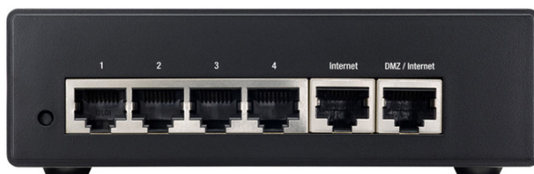
Figure 2. Back Panel of the Cisco RV042G

Figure 2 shows the back panel of the Cisco RV042G. Figure 3 shows a typical configuration.